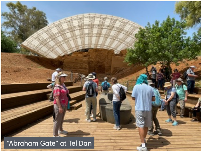
"Abraham Gate" at Tel Dan