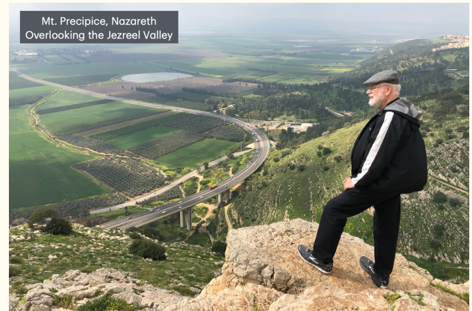
Mt. Precipice, Nazareth Overlooking the Jezreel Valley